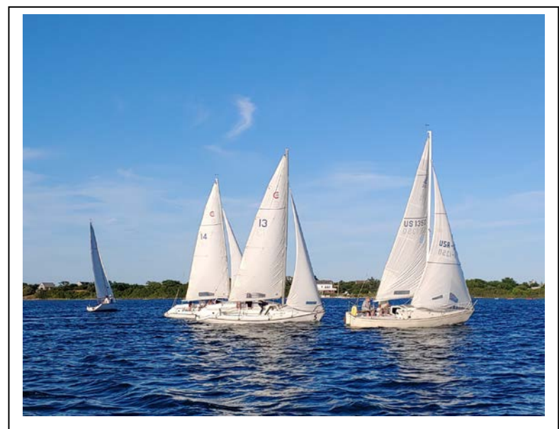
Thursday Night Sailing Race Start in the Great Salt Pond

leeward course set in the recreational area in the northern section of the Great Salt Pond. The courses are typically about a mile and a half or twenty minutes long which allows three races to be run each evening. The Race Committee was run by BICS